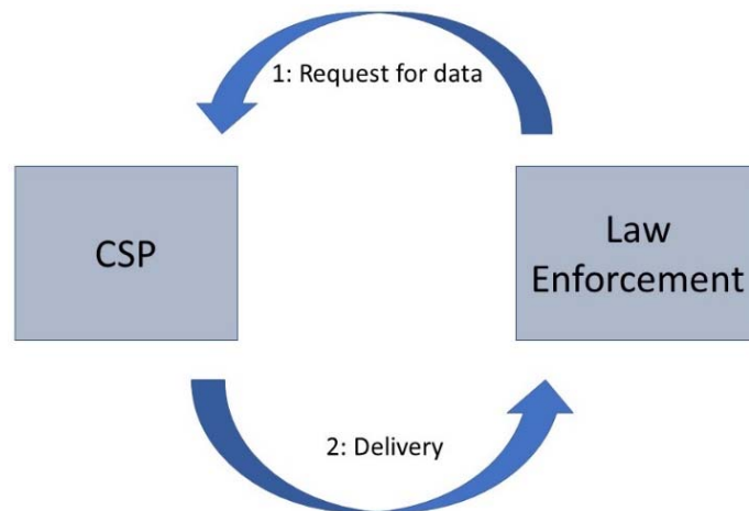
Figure 1: Reference model

Request means submission of a request for data and delivery means handover of the material that was identified by the CSP as meeting the request. Figure 1 shows the reference model.