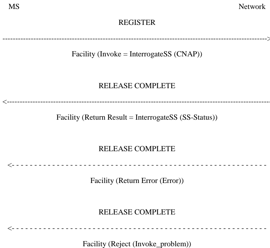
Figure 2: Interrogation of calling name identification presentation

The mobile subscriber can request the status of the supplementary service and be informed if the service is provided to him/her.