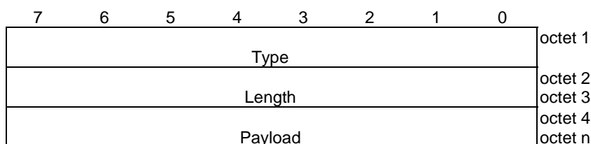
Figure 7.1.2.1-1: Generic FTT-IMS envelope

Generic FTT-IMS envelope is coded according to figure 7.1.2.1-1 and table 7.1.2.1-1.