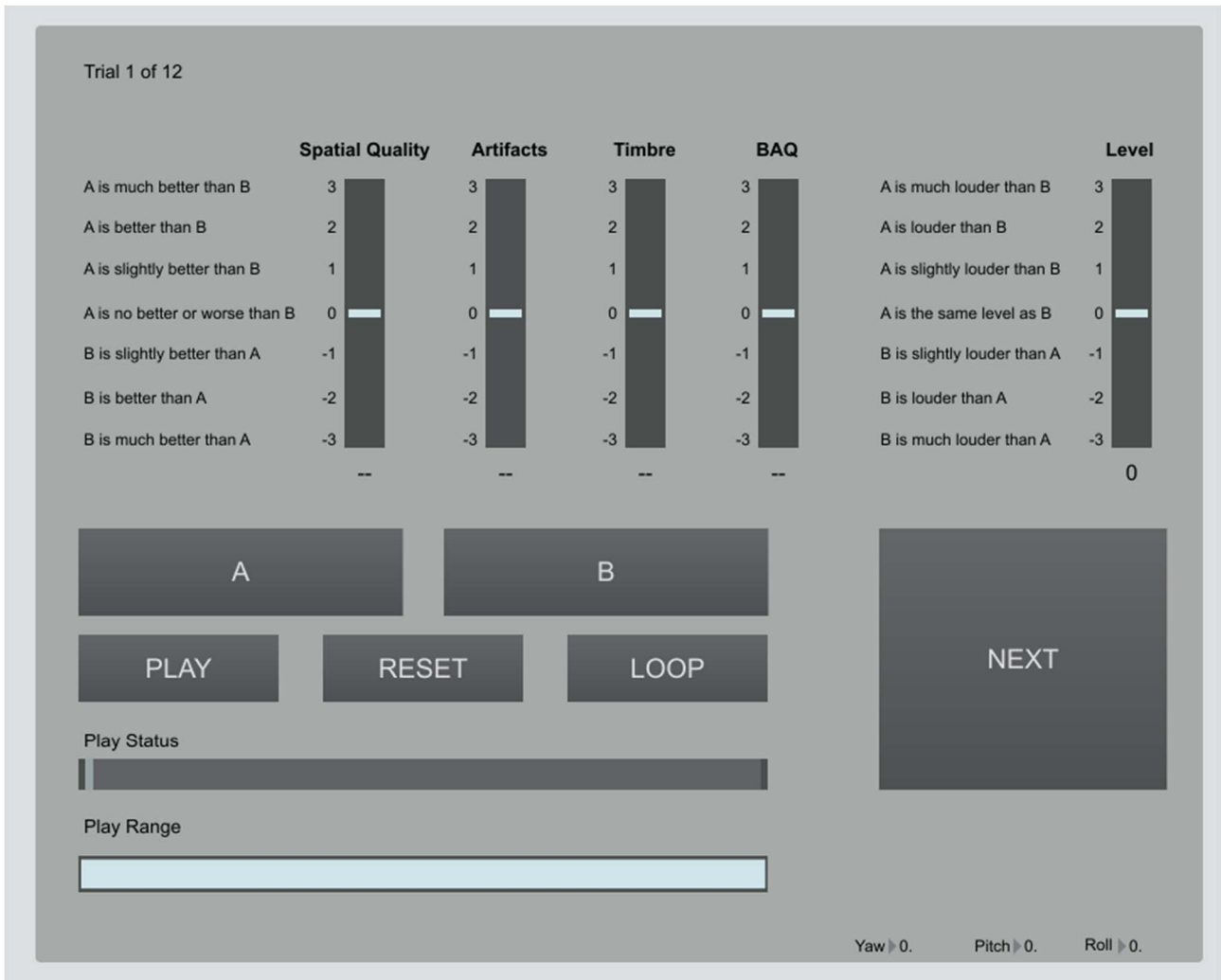
Figure 1: Example of possible GUI for Rendering Comparison Test