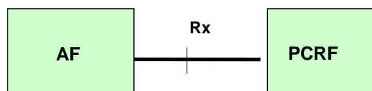
Figure 4.2.1: Rx reference model

The Rx reference point is defined between the PCRF and the AF. The relationships between the different functional entities involved are depicted in figure 4.2.1. The overall PCC architecture is depicted in subclause 3a of 3GPP TS 29.213 [9].