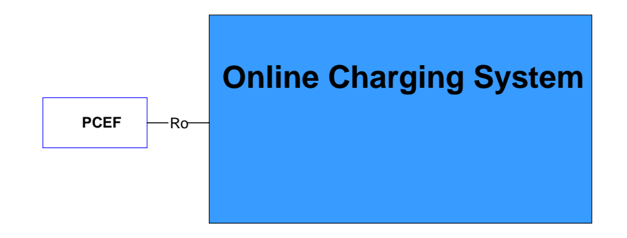
Figure 4.3-1: PS domain online charging architecture

PS domain online charging based on P-GW functions with included PCEF is specified in the present document, utilising the Ro interface and application as specified in TS 32.299 [50]. The reason for this alternative solution is that operators may enforce the use of HPLMN P-GWs in the case of roaming, hence P-GW service control and charging can be executed in the HPLMN in all circumstances. The P-GW based PS domain online charging architecture is depicted in figure 4.3-1.