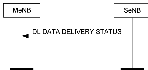
Figure 5.4.2.1-1: Successful Downlink Data Delivery Status

After being reported to the MeNB, the SeNB removes the respective PDCP sequence numbers.