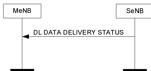
Figure 5.4.2.1-1: Successful Downlink Data Delivery Status

After being reported to the MeNB, the SeNB removes the respective PDCP sequence numbers.