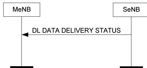
Figure 5.4.2.1-1: Successful Downlink Data Delivery Status

After being reported to the MeNB, the SeNB removes the respective PDCP sequence numbers.