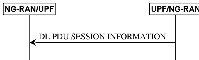
Figure 5.4.1.1-1: Successful Transfer of DL PDU Session Information

When needed, the NG-RAN shall propagate the DL PDU Session Information to a peer NG-RAN.