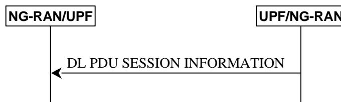
Figure 5.4.1.1-1: Successful Transfer of DL PDU Session Information

When needed, the NG-RAN shall propagate the DL PDU Session Information to a peer NG-RAN.