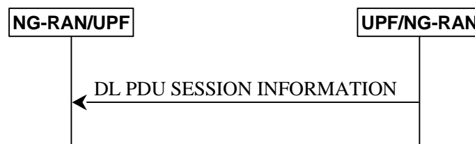
Figure 5.4.1.1-1: Successful Transfer of DL PDU Session Information

When needed, the NG-RAN shall propagate the DL PDU Session Information to a peer NG-RAN.