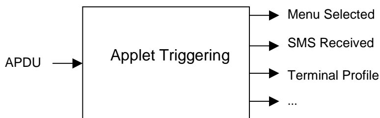
Figure 3: toolkit applet triggering diagram

The ME shall not be adversely affected by the presence of applets on the SIM card. For instance a syntactically correct Envelope shall not result in an error status word in case of a failure of an applet. The only application as seen by the ME is the SIM application. As a result, a toolkit applet may throw an exception, but this error will not be sent to the ME.