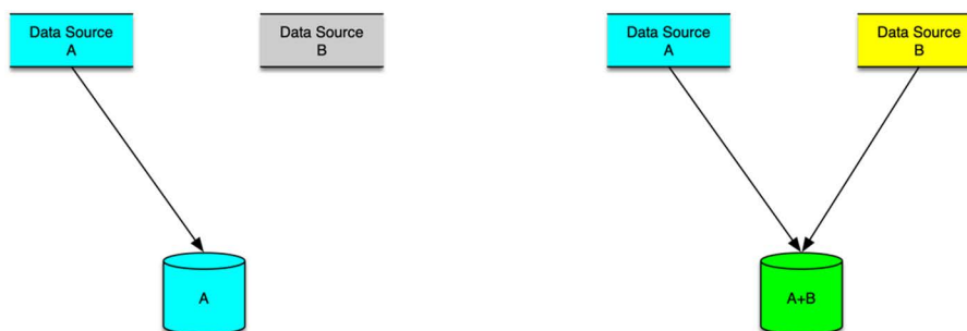
Figure 1: Single and Multi-sourced data