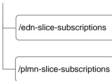
Figure 8.3.1.3.1-1: Resource URIs structure of the NSCE_SliceInfo API

Table 8.3.1.3.1-1 provides an overview of resources and applicable HTTP methods defined for the NSCE_SliceInfo API.